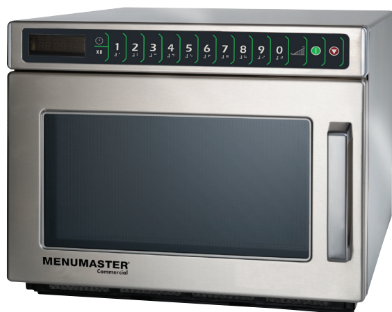
Model MDC12A2 shown