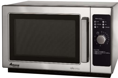
Model RCS10DS shown