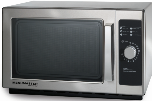
Model MCS10DS shown